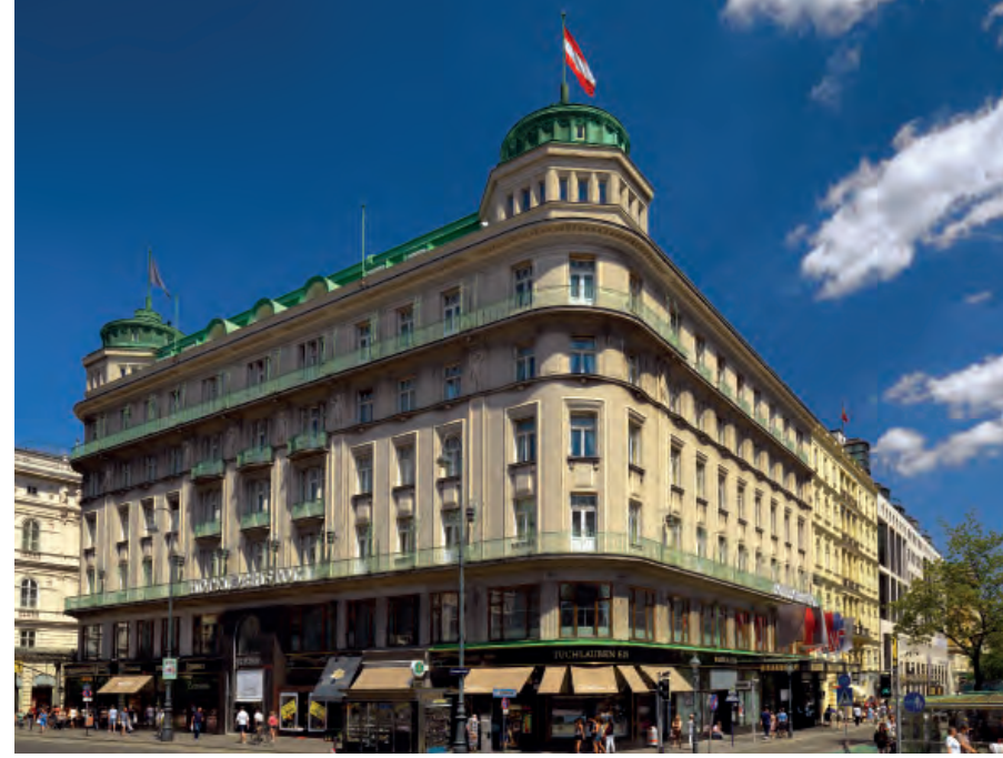
Hotel Bristol, Vienna

Hotel Kaiserhof Vienna is situated a few steps away from Naschmarkt and the State Opera