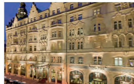
Hotel Paris, Prague