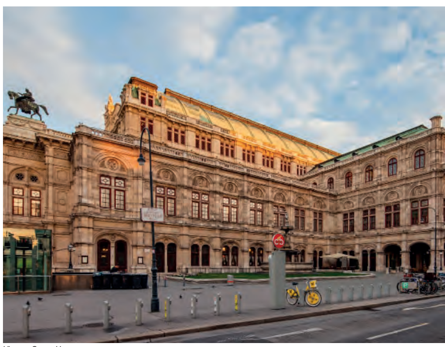
Vienna, Opera House

Either fly back to the UK after your 7-night rail tour or if returning by train, take the overnight sleeper service from Vienna to Cologne, and then a morning train to Brussels and on to London by Eurostar, arriving on what is day ten of the tour.