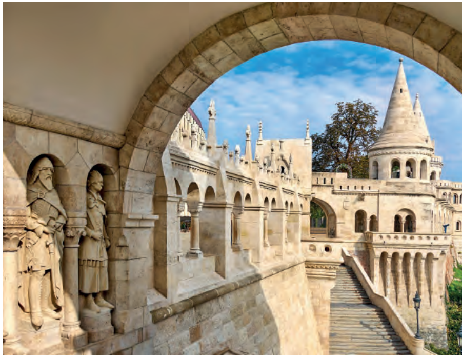
Fishermen's Bastion, Budapest

Opera House where you can experience a guided tour or an opera performance. On two-mile long, tree-lined Andrassy ut you will find elegant shops and houses, Heroes Square and the Museum of Fine Arts. The thermal springs of Budapest have been enjoyed since Roman times and baths are to be found in both Buda and in Pest, where the Szechenyi Baths are one of the largest bathing complexes in Europe, with outdoor and indoor pools, built in modern Renaissance style.