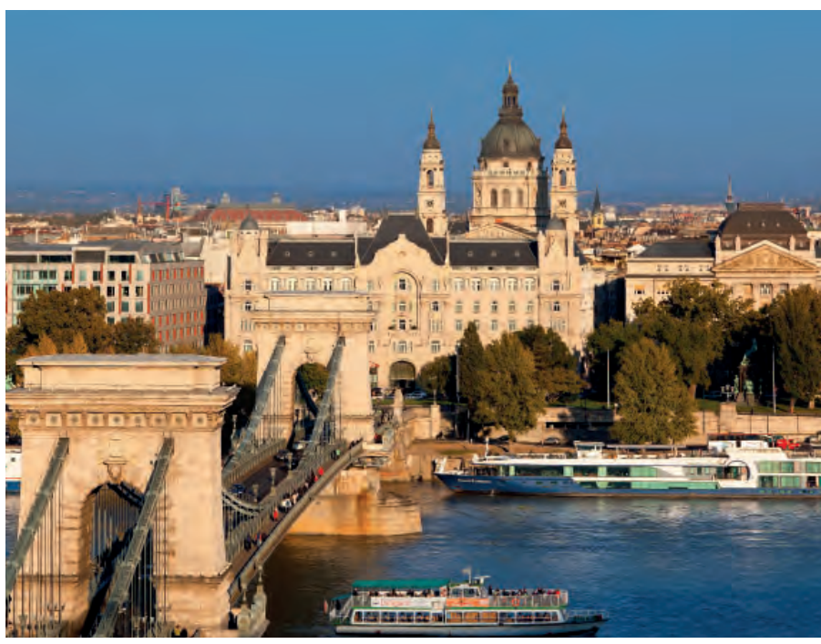
Chain Bridge, Budapest

In Budapest explore the tree-lined boulevards of Pest and the cobbled hilly streets of Buda. The city straddles a curve in the River Danube and is packed with interesting sights to visit on foot but also easily reached by underground. Visit the Castle District in Buda where you can find mediaeval buildings such as the Royal Palace which has been rebuilt several times over the past seven centuries and houses the National Gallery, Budapest Historical Museum and the Museum of Contemporary Art. You can also visit the 13th Century St Matthias Church and the neo-Gothic Fishermen's Bastion nearby. The world-famous Gellért