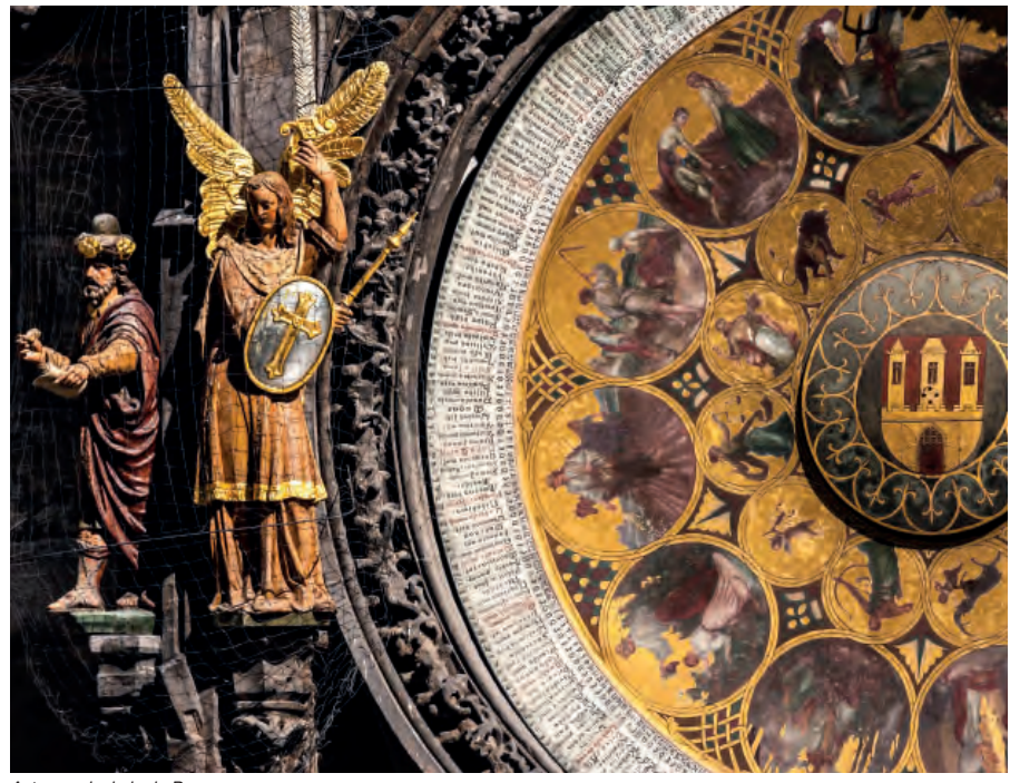
Astronomical clock, Prague

This luxury rail touring holiday encompasses a trio of central European cities: Prague, Vienna and Budapest. Each city bears witness to some of the most striking events in the history of Europe and boasts an abundance of fascinating sights and places to visit including imperial palaces, ancient castles and iconic architecture. Each city exhibits its common historic links yet has an incredible character and vibrancy of its own.