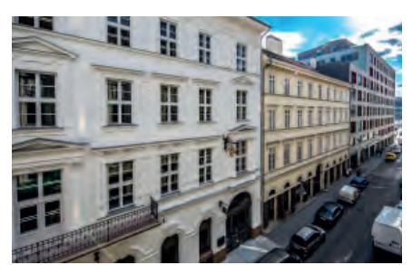
Hotel Prestige, Budapest